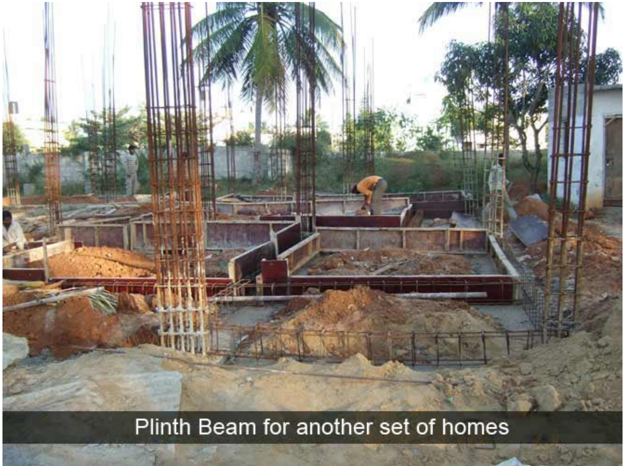
Plinth Beam for another set of homes