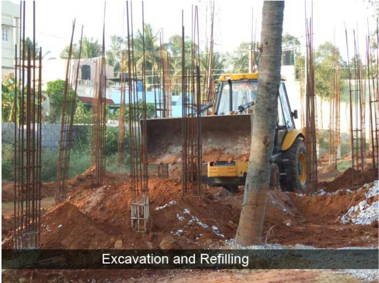
Excavation and Refilling