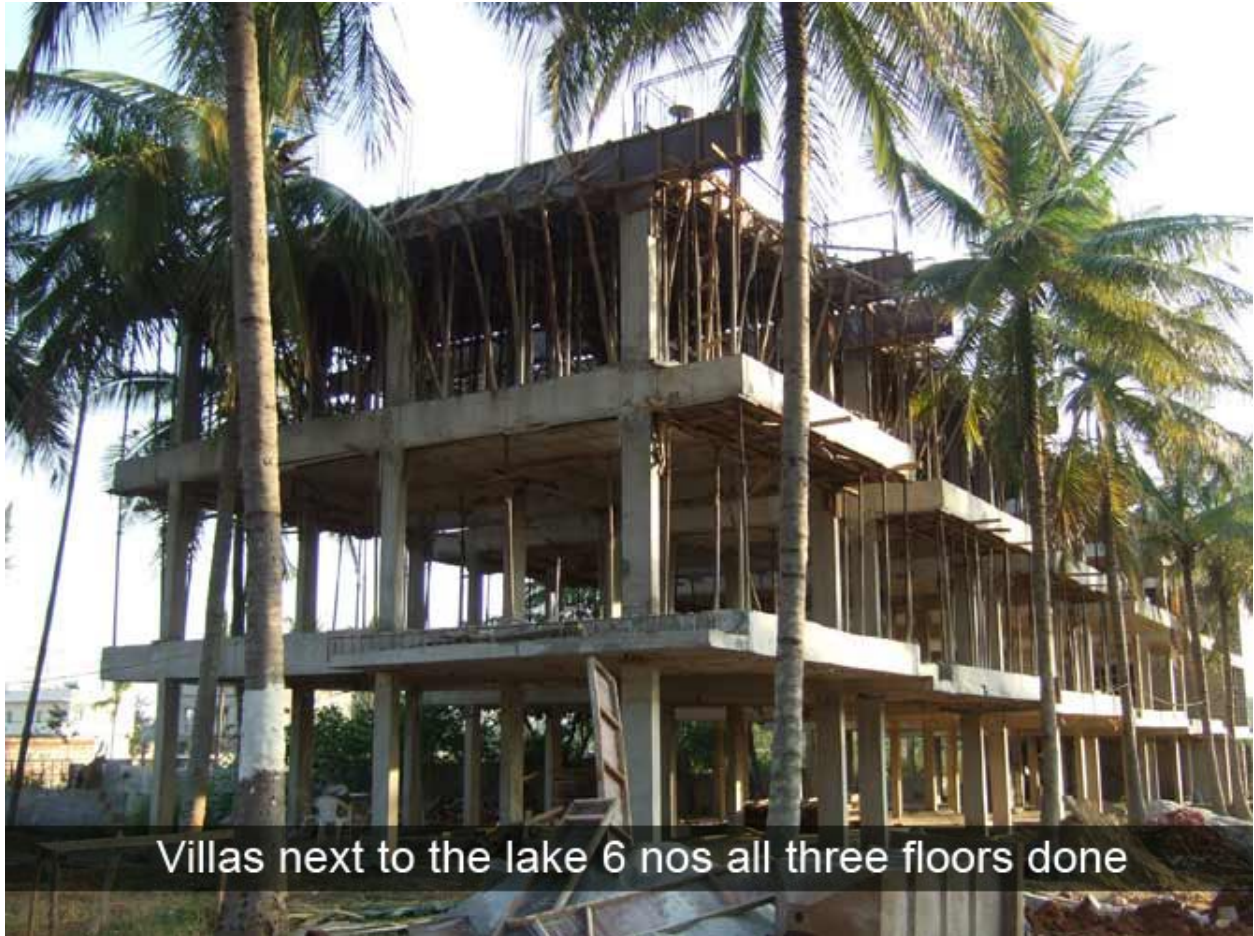
Villas next to the lake 6 nos all three floors done