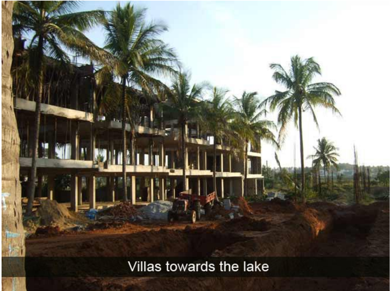
Villas towards the lake