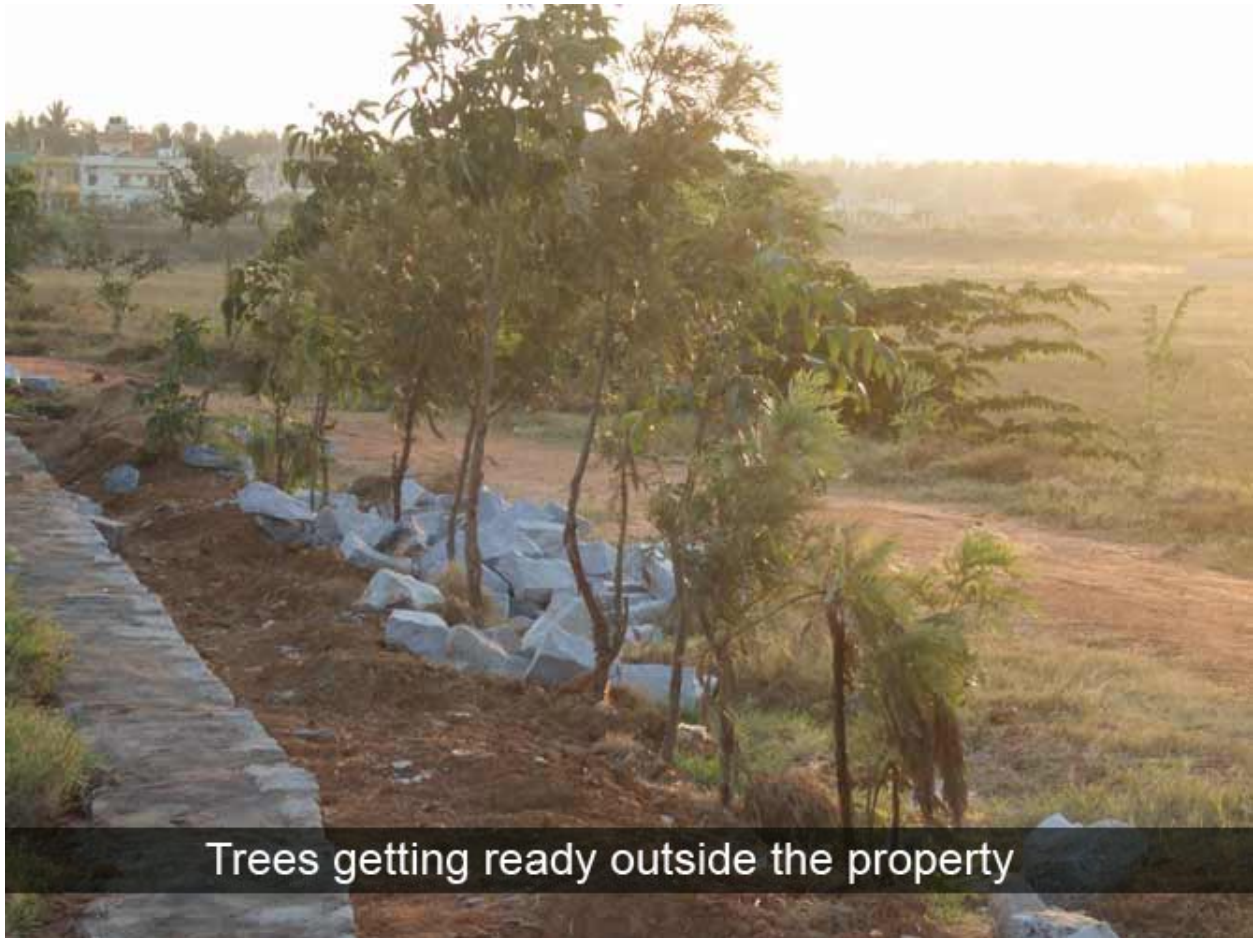
Trees getting ready outside the property