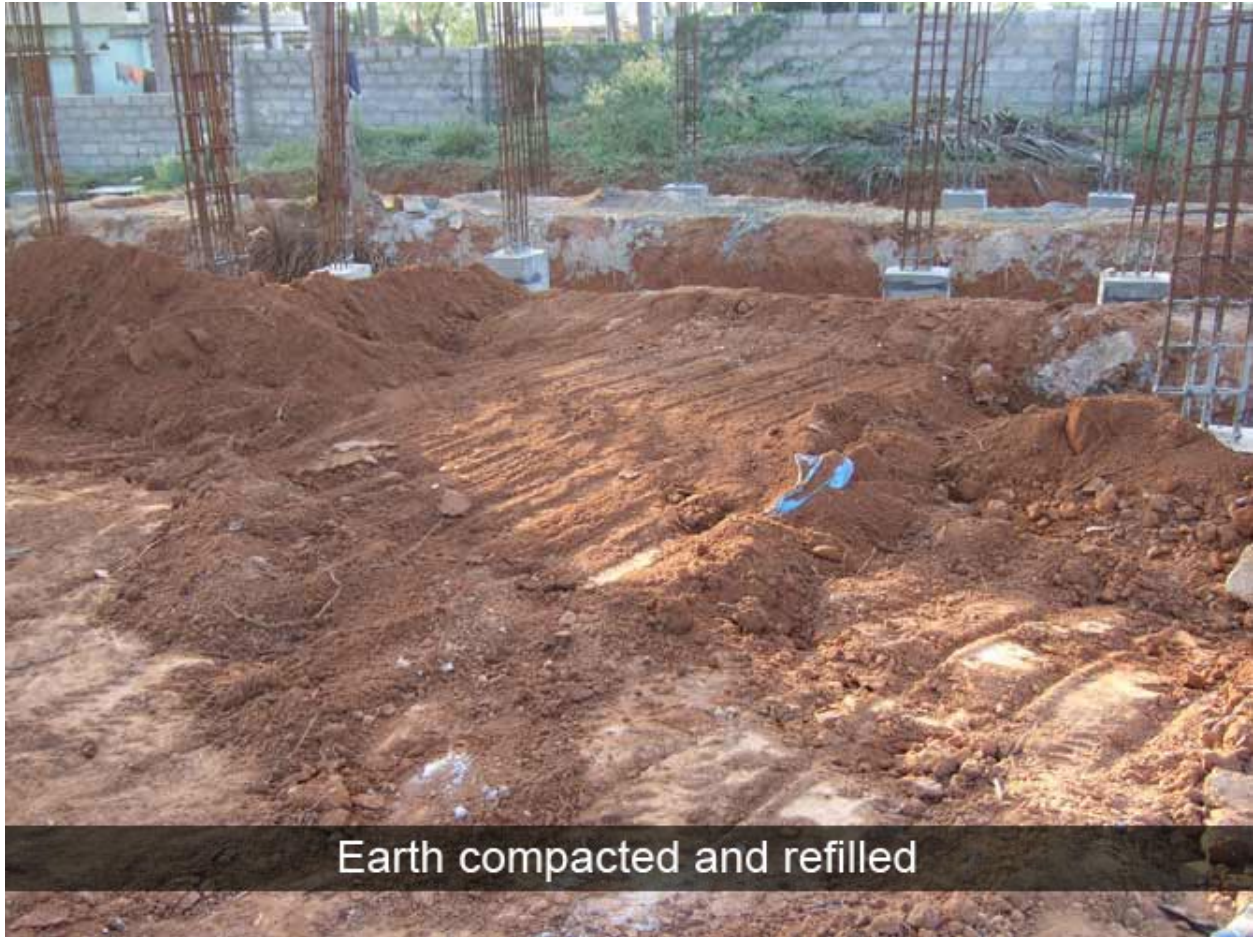
Earth compacted and refilled