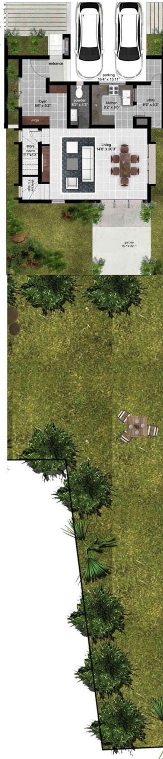
TYPE W-B(3BHK) site area: 3931sqft